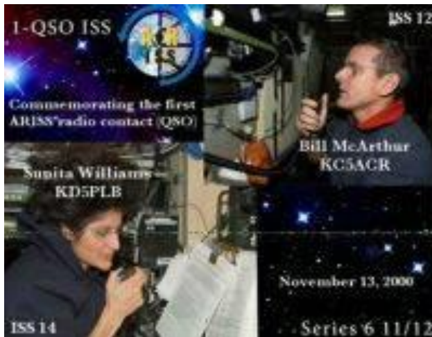
SSTV Image from the ISS commemorating the 15 th anniversary of ARISS on the ISS. This event took place in mid April 2016.