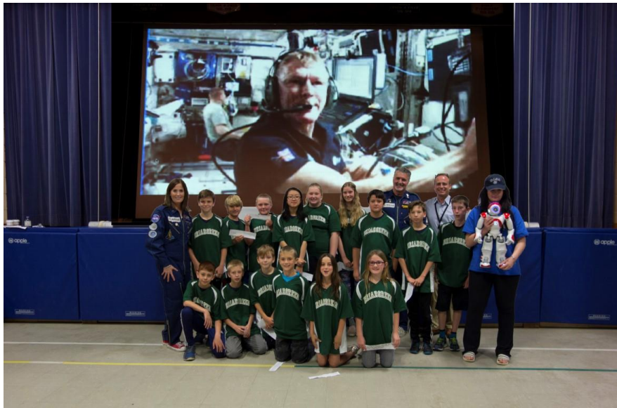
ARISS contact at Briargreen Public School, Nepean, ON, Canada - June 13, 2016