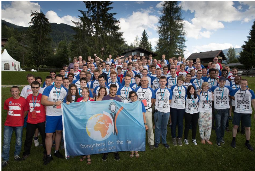
ARISS contact at YOTA Camp 2016 IARU-R1, Salzburg, Austria - July 18, 2016